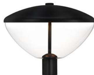
CEDER A1-BRIGHT Anodized (black)