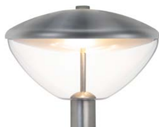
CEDER A3-NIGHT Non-anodized