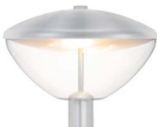
CEDER A3-NIGHT White anodized