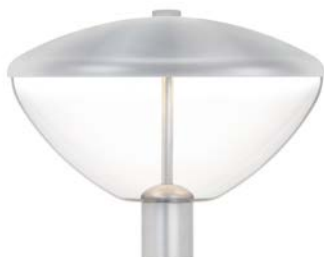
CEDER A1-BRIGHT White anodized