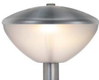
CEDER A2-WHITE Non-anodized