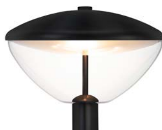
CEDER A3-NIGHT Anodized (black)