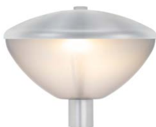
CEDER A2-WHITE White anodized