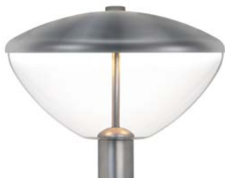
CEDER A1-BRIGHT Non-anodized