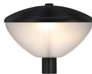
CEDER A2-WHITE Anodized (black)